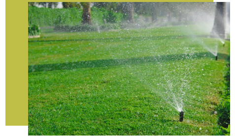
Turf grass lawns require consistent watering

Water Dependency – Due to their status as non-native to North America, common turf grass species require large quantities of water. Every day, the average household uses nearly 100 gallons of water to irrigate their lawn 11 . Including rainfall, a typical 4,000 square foot lawn in the Midwest can require over 44,000 gallons of water during the summer 12 . This is particularly harmful in Ottawa County, as subsurface geology inhibits recharge of the aquifers supplying irrigation water. To reduce the depletion of this vital water resource, native plantings that don't require extensive irrigation can be allowed and encouraged through landscaping regulations.