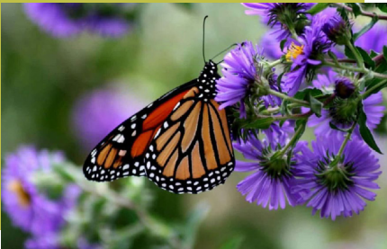
Turf grass lawns limit biodiversity, harming pollinator species

Chemical Applications – Non-native turf grass species require extensive applications of pesticides and herbicides to maintain their emerald-green shimmer. Not only are these substances toxic to local wildlife populations, these chemicals seep into the soil, poisoning organisms needed for healthy, nutrient-rich soils 9 . Runoff from pesticides and herbicides also regularly enter water bodies 10 , creating algae blooms that threaten aquatic habitats and invaluable natural features.