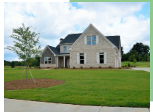
Pictures top to bottom: 1.) Hampton Court Palace, United Kingdom 2.) Levittown, New York 3.) Central Park, New York City 4.) New suburban construction featuring turf grass lawn