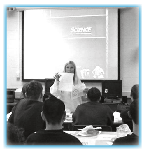
Video Conference in Detention Center

Circuit Court Case Management System (CCCMS) is a secure, web-based, software program that allows professionals to communicate with one another on common cases and affords the Court a dynamic, common data base. Through the support of Michigan's Child Care Fund and Ottawa County, the Circuit Court's Juvenile Services Division partnered with Technology Professionals Corporation of Grand Rapids to develop this program. It was successfully launched in October 2005. Refinements continue but currently, the Court has witnessed enormous contributions from this program and hopes to expand its use into other divisions within the Court. Also, inquiries from other courts throughout the State regarding the purchase of this software have ignited further discussion about potential revenue that may result from its development.