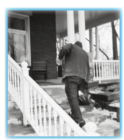
Community service participant shoveling snow at Parkview Adult Foster Care Home

The Courts appreciate these agency contributions and look forward to forming additional partnerships toward the goal of service excellence.