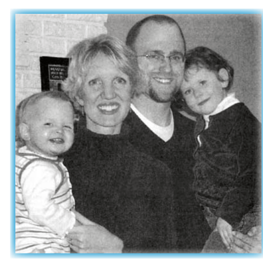
Adoption Day 2005

Adoption Day is celebrated annually, in order to increase awareness of the 20th Circuit Court's adoption services available throughout the year. More than 4,000 children in Michigan are waiting for permanent homes; Adoption Day's purpose is to invite potential adoptive parents to reach out to these children and make a life-long commitment. Also, on Adoption Day, agencies such as Adoption Associates, Bethany Christian Services and Catholic Social Services bring together prospective parents with children in need of a permanent home and finalize their adoptions. On Adoption Day 2005, the 20th Circuit Court confirmed eight adoptions including a 17 year–old, young man.