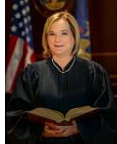
Judge Judith Mulder