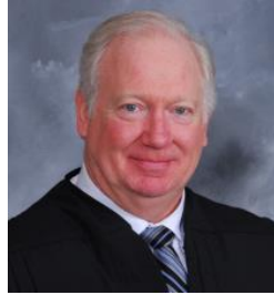
Judge Kent Engle