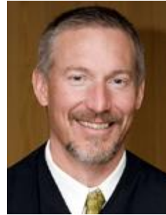
Judge Jon Hulsing