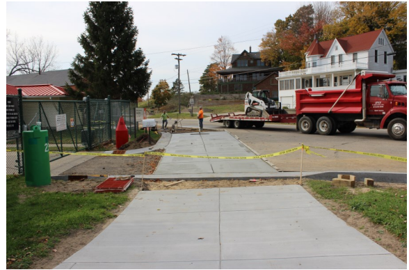
New walkway in front of Coast Guard station

09.27.14 Boardwalk and concrete construction is complete. Restoration work is in progress. Carpentry for the historic kiosk is now completed. The roof, painting and installation of the interpretive panels and audio device will be completed soon. Work around the Coast Guard station will begin in October. Site work around the pumphouse will begin after work on the pumphouse foundation is completed.