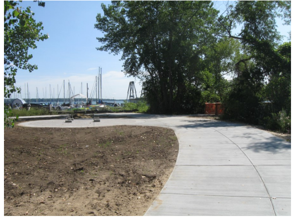
Historic Display location with Parkside Marina in background

07.31.14 Boardwalk and concrete construction are nearing completion. Restoration work is in progress. The historic kiosk was delayed due to complications with the trusses and other structural issues, but is now in progress. Work around the pumphouse and Coast Guard station will begin in October in conjunction with the Pumphouse restoration.