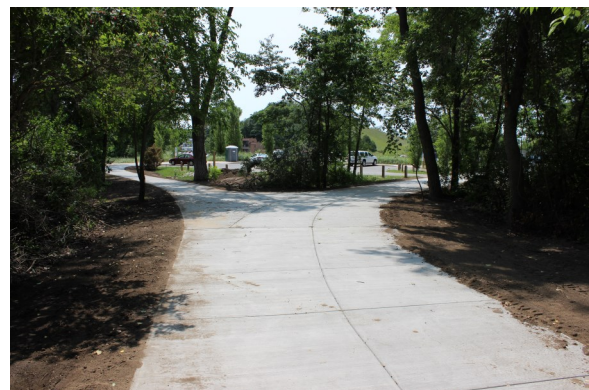
New concrete walk connection to west parking

06.25.14 Construction including steel and wood framing for the boardwalk is in progress. Concrete abutments for the boardwalk have been completed and concrete flatwork is in progress.