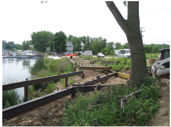
New boardwalk looking west from pumphouse