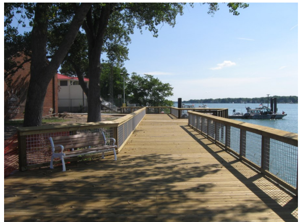
New boardwalk looking east at pumphouse