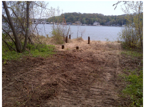
Cleared location of Lake Macatawa overlook