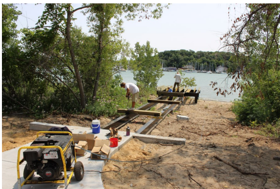
New wildlife viewing deck framing in progress