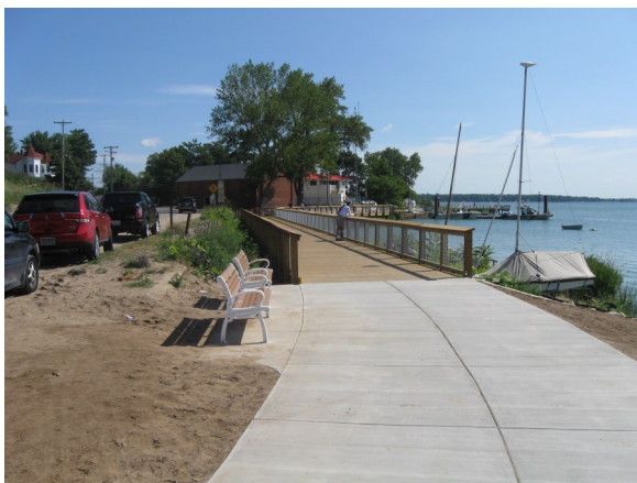
Completed boardwalk looking east from marina