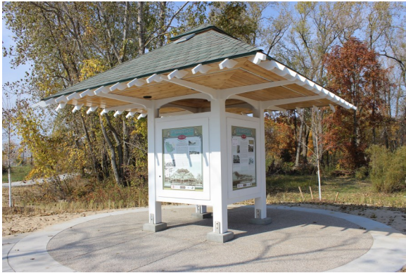
Completed hotel history kiosk

10.30.14 Work on the historic kiosk including painting and the audio equipment has been completed. Curb and walkway work in front of the Coast Guard Station is in progress.