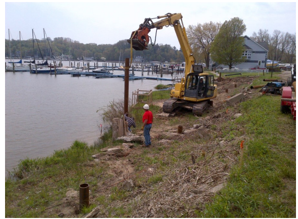
Installing metal pipe piling at new boardwalk location

04.25.14 Construction has begun with clearing of brush completed. Driving of piling for the boardwalks will start soon. Coordination with the Road Commission continues with efforts to take into account the future resurfacing of Ottawa Beach Road.