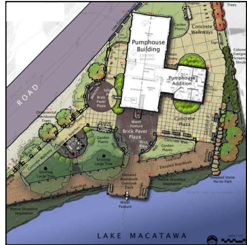
Pumphouse Museum Plan