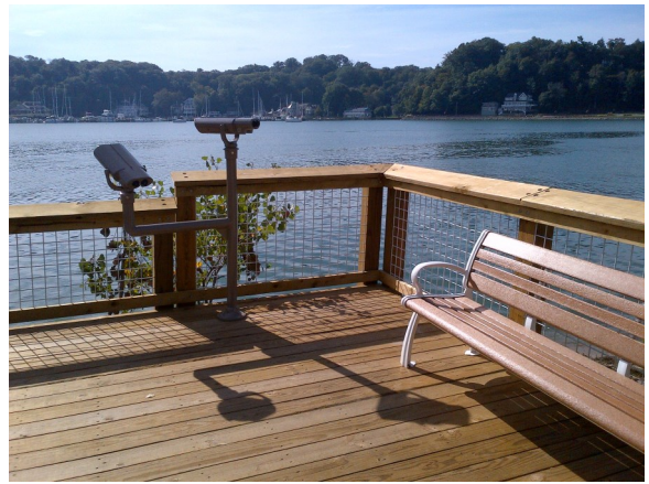
Binoculars and bench at overlook

08.27.14 Boardwalk and concrete construction are nearing completion. Restoration work is in progress. The historic kiosk was delayed due to complications with the trusses and other structural issues, but is now in progress. Work around the pumphouse and Coast Guard station will begin in October in conjunction with the Pumphouse restoration.