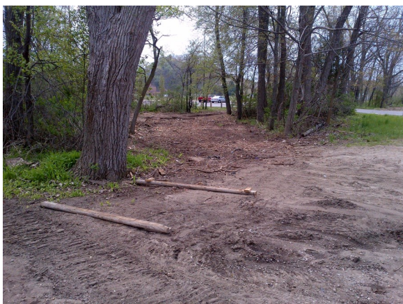
Site clearing for new walks

05.28.14 Construction is in progress. Site preparation and clearing is completed. Steel piling for the boardwalk and lake overlook is complete with steel framing in progress. Design work on the historical panels is almost complete as well as the draft narrative for the audio portion of the interpretive kiosk.