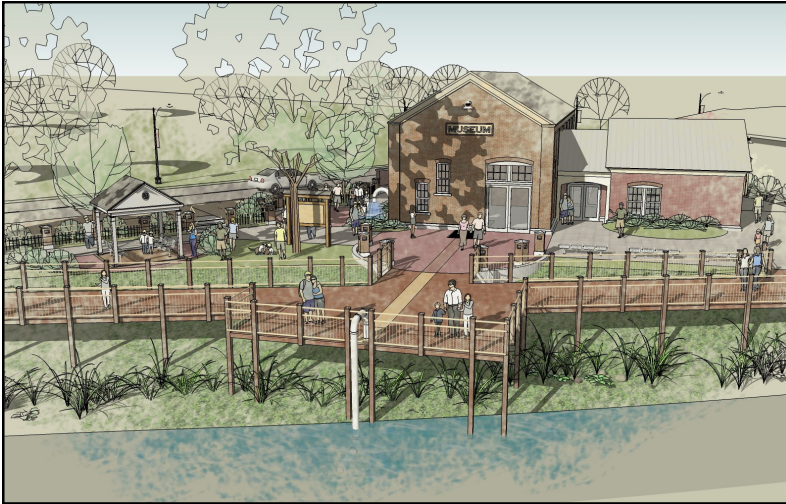
Proposed pumphouse improvements looking from south

The project will be complemented and enhanced by two other projects being studied and planned on this section of shoreline. First, the renovation of the historic red brick ‘pumphouse’ building into a historic museum will provide another point of interest along the pathway if private fundraising efforts are successful. Second, improvements to the existing Parkside Marina lease area are also being studied to determine ways to improve public access and the aesthetics.