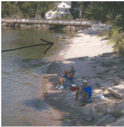
Concrete foundation at Holland Harbor