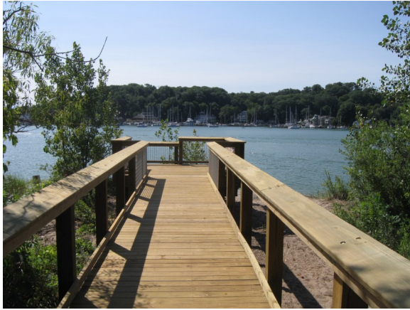
New wildlife viewing deck