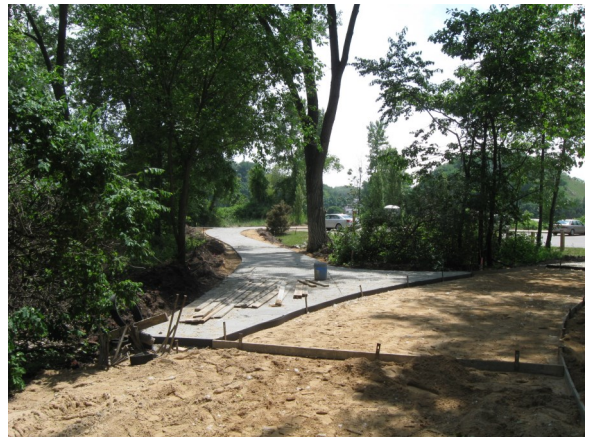
New concrete walk connection to west parking

05.28.14 Construction is in progress. Site preparation and clearing is completed. Steel piling for the boardwalk and lake overlook is complete with steel framing in progress. Design work on the historical panels is almost complete as well as the draft narrative for the audio portion of the interpretive kiosk.