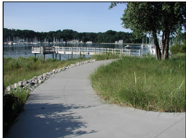
Black Lake Boardwalk