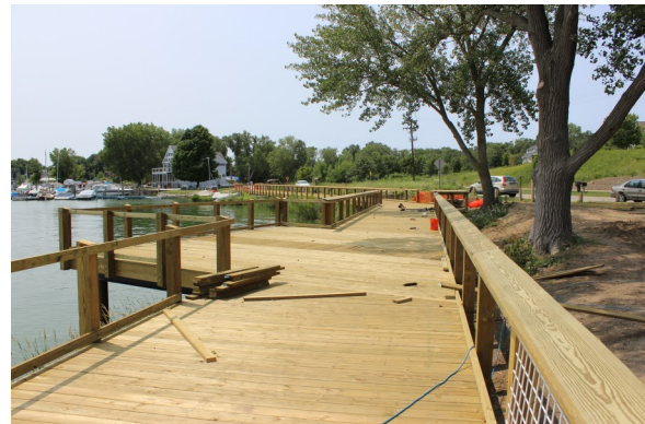
New boardwalk looking west from pumphouse