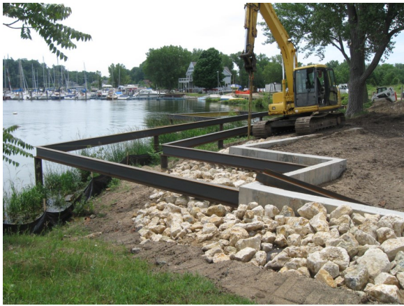
Concrete abutment and steel framing for boardwalk at east end of project