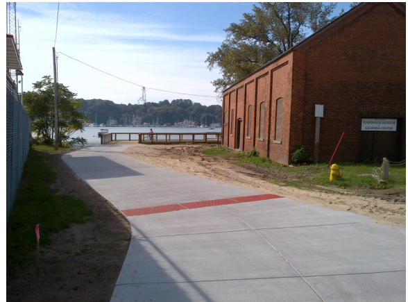
Pumphouse site prepared for final work