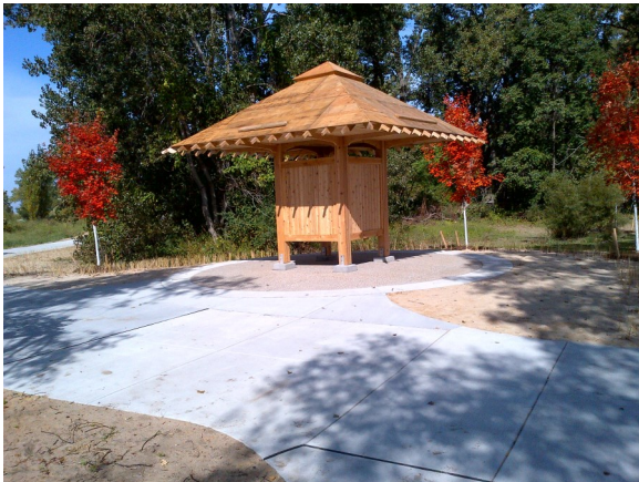
Historic kiosk with new tree plantings

09.27.14 Boardwalk and concrete construction is complete. Restoration work is in progress. Carpentry for the historic kiosk is now completed. The roof, painting and installation of the interpretive panels and audio device will be completed soon. Work around the Coast Guard station will begin in October. Site work around the pumphouse will begin after work on the pumphouse foundation is completed.