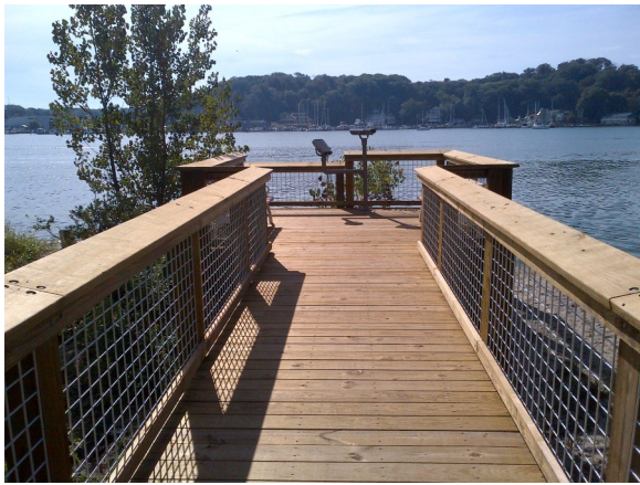
New overlook deck