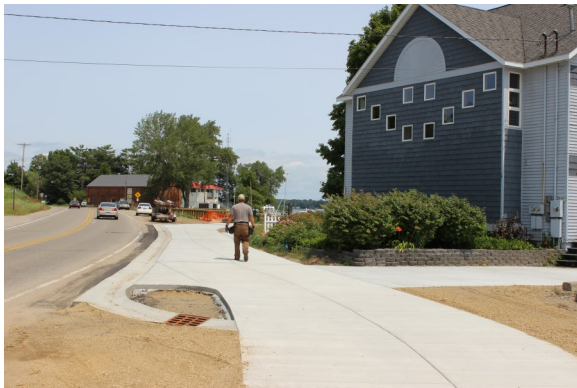
New concrete walk in front of private Parkside Marina property

07.31.14 Boardwalk and concrete construction are nearing completion. Restoration work is in progress. The historic kiosk was delayed due to complications with the trusses and other structural issues, but is now in progress. Work around the pumphouse and Coast Guard station will begin in October in conjunction with the Pumphouse restoration.