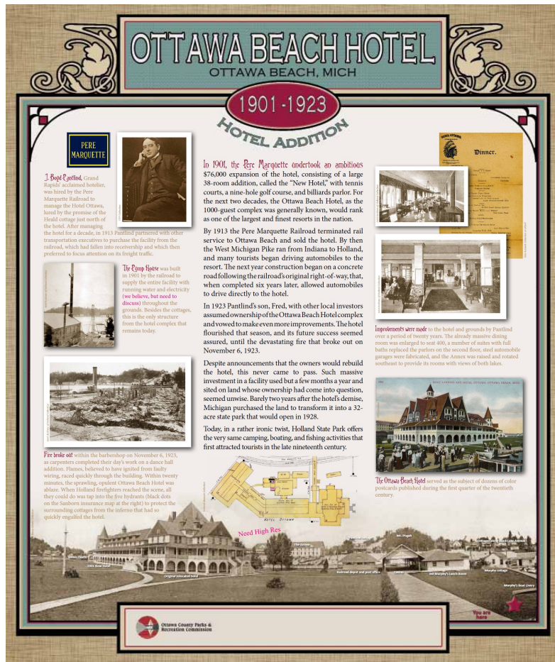
Draft Interpretive panel

12.23.14 We are still awaiting a permit from the Corps of Engineers after providing additional requested information. Coordination with the Road Commission has been completed. We are still hopeful to bid this project this winter for spring and early summer construction.