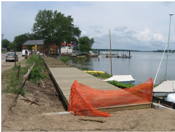
New boardwalk looking east from marina area