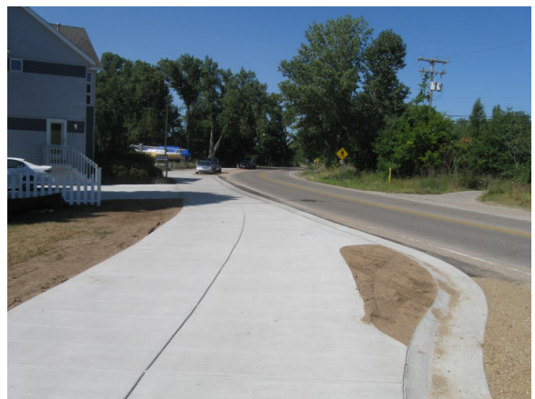
New walkway in front of private property