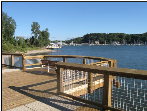
Holland Harbor Fishing Access