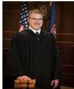
Judge Craig Bunce