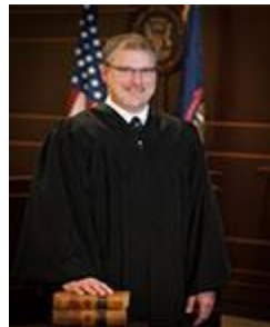
Judge Craig Bunce