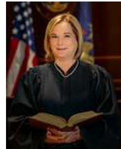
Judge Judith Mulder