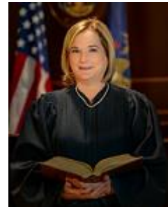
Judge Judith Mulder