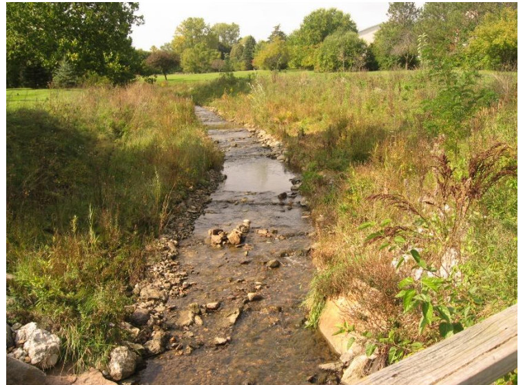
One-year post construction