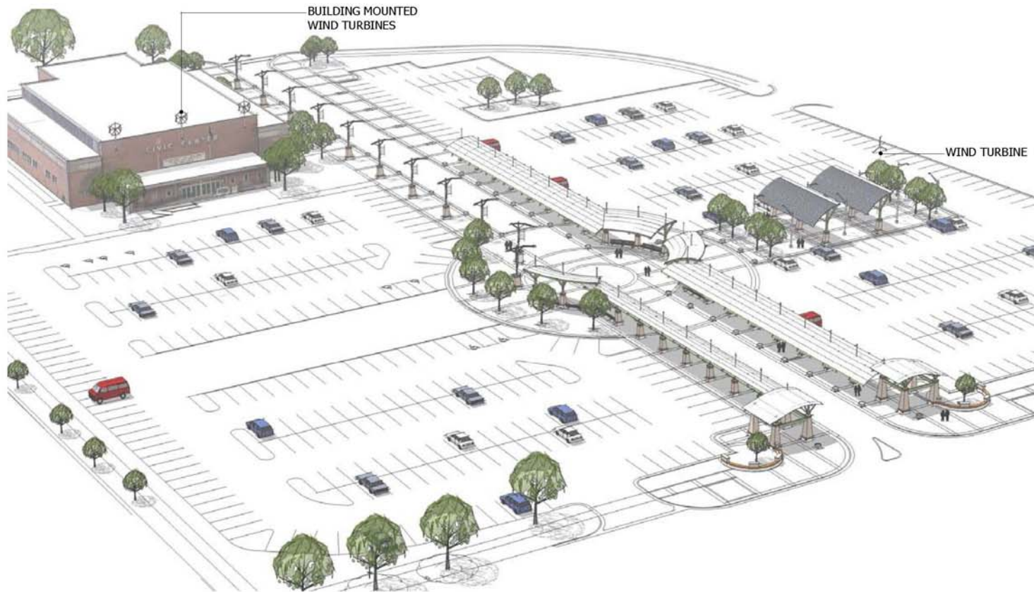
Birdseye View Looking Northwest