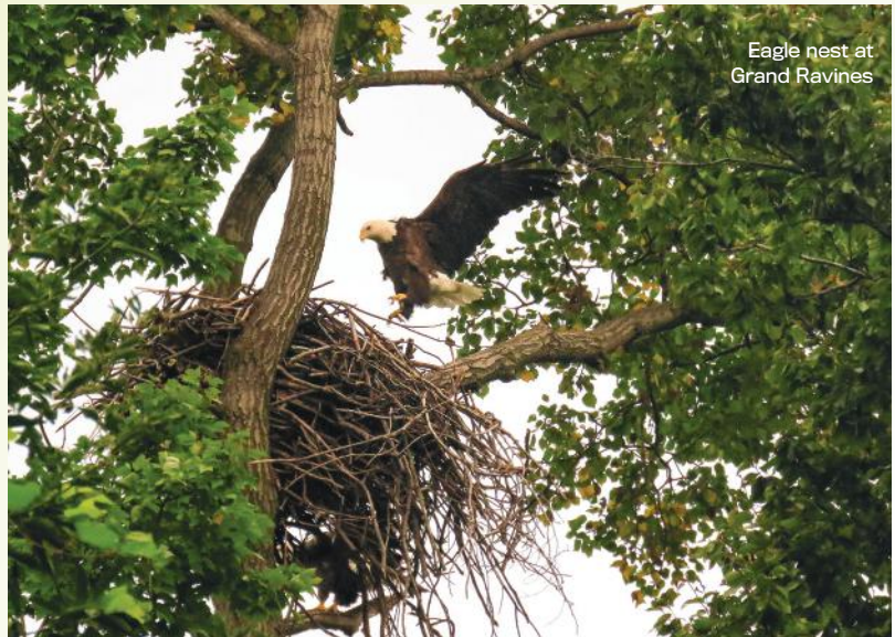
Eagle nest at Grand Ravines