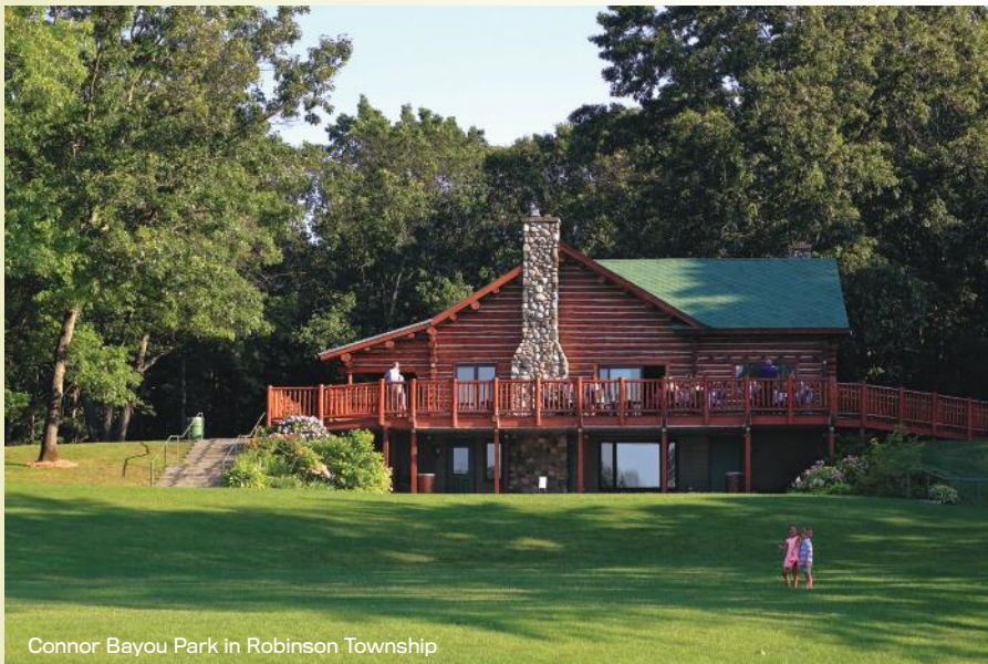
Connor Bayou Park in Robinson Township

ment for the past 20 years. Its goal: protecting thousands of acres of natural lands, creating green infrastructure, developing new recreational opportunities and connecting communities.