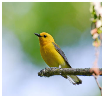
Prothonotary Warbler - Ryan B.