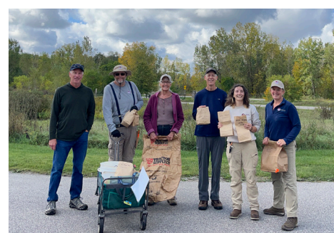
Park Stewards completed 33 workdays. Thank you for your dedication!