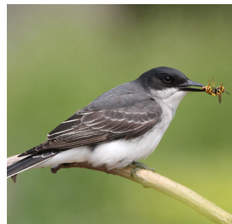
Eastern Kingbird - Lucas T.