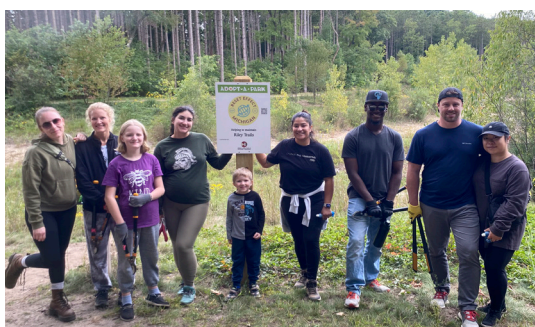
Five new organizations joined our Adopt-a-Park program including Reset Effect at Riley Trails.