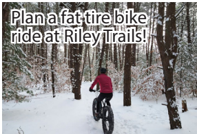
Plan a fat-tire bike ride at Riley Trails!

Hemlock Crossing offers snowshoe rentals for adults and children at the Nature Center during regular business hours. Children can snowshoe for free with adult rental. While skis are not available to rent, they are welcome on the trails. Dog walking is allowed on the trails on leash.