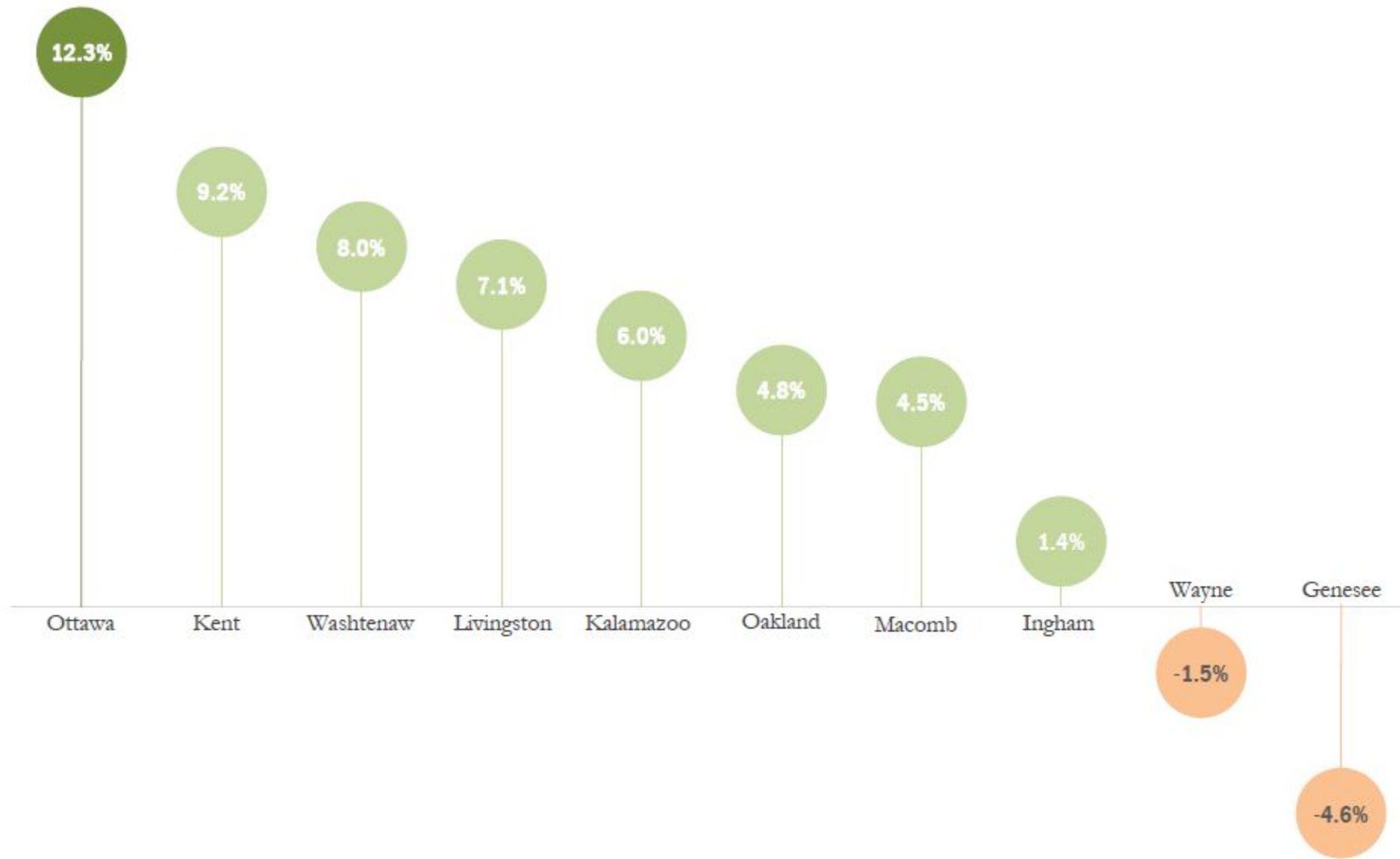
2010 - 2020 population growth rates for Michigan's 10 largest counties