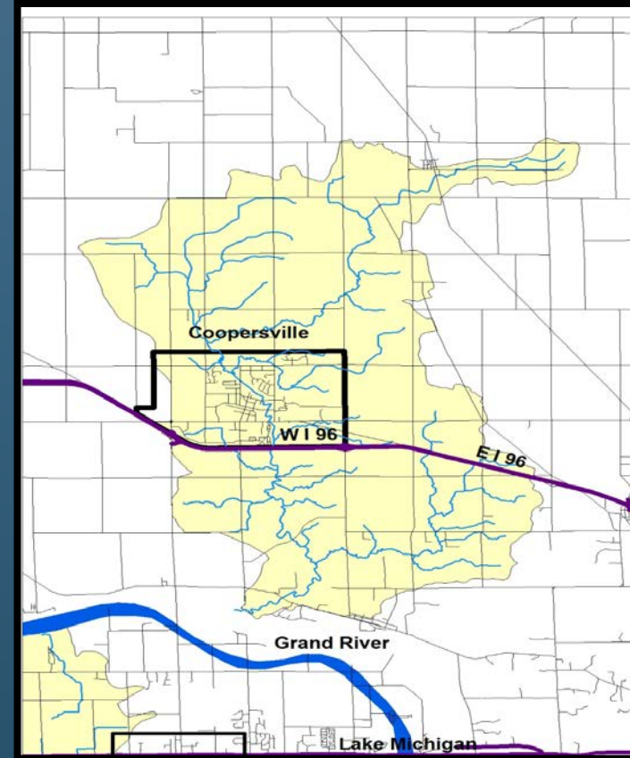
Deer Creek Watershed